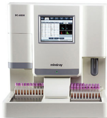
BC-6800 Auto Hematology Analyzer Exclusive Technology, Inclusive Approach